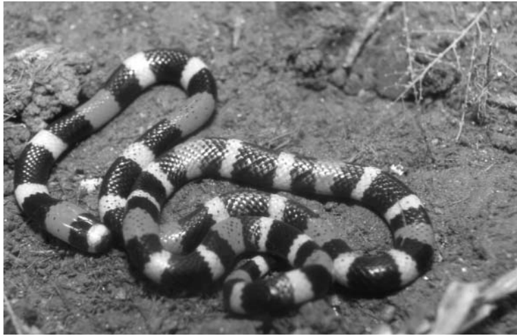
Fig. 2: Micrurus lemniscatus (CVULA 6499). Unsexed juvenile (SVL + TL 235 + 25 mm) from Barinitas, Venezuela. Abb. 2: Micrurus lemniscatus (CVULA 6499). Jungtier unbekanntes Geschlechts (Kopf-Rumpflänge + Schwanzlänge 235 + 25 mm) aus Barinitas, Venezuela.

niscatus from Guyana (ROZE 1996), and about 800 km W of the closest known population of M. l. diutius in eastern Venezuela, and about 700 km NW of the apparent known range of M. l. helleri in extreme southern Venezuela (Amazonas state; see fig. 1). In Colombia, M. l. helleri reaches the Andean piedmont NE of Villavicencio to just SW of the boundary with Venezuela (CAMPBELL & LAMAR 1989), at about 300 km SW from Barinitas.