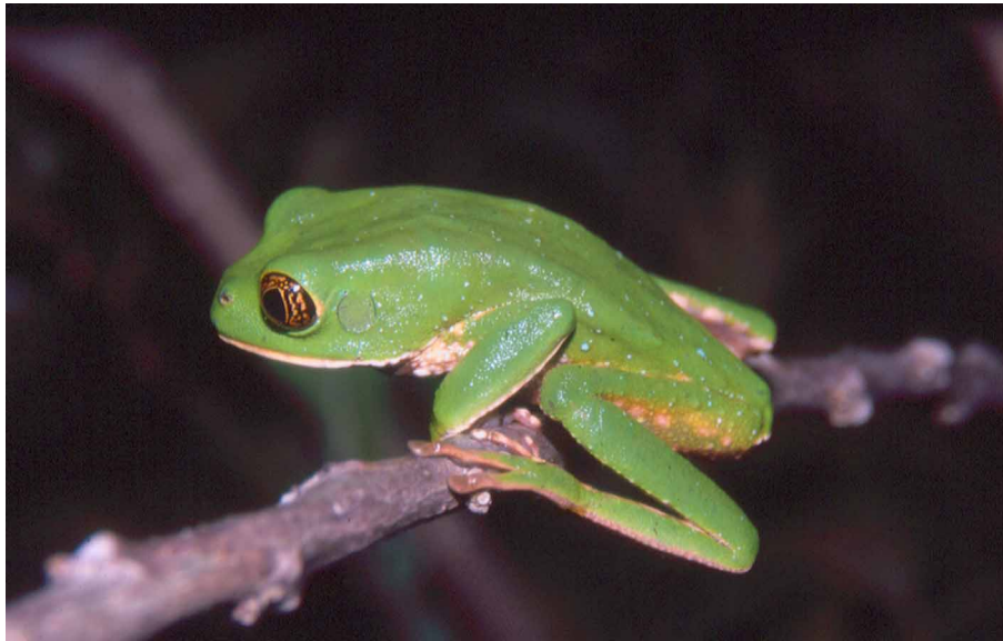
FIGURE 1. Phyllomedusa neildi sp. nov. male in life (specimen not collected) from type locality.

Axillary membranes absent; arms slender, forearms moderately robust in males; ulnar fold indistinct; indistinct row of protuberances, in some specimens; relative length of fingers I<II<IV<III; finger discs approximately \frac{2}{3} of TD; palmar tubercle small, round, flat, indistinct; thenar tubercle oval, protuberant, double size of palmar tubercle; subarticular tubercles round, conical; supernumerary tubercles round, slightly overlapping to conical, variable in number; webbing absent between fingers (Fig. 6A).