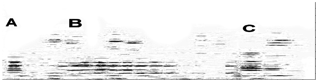
FIGURE 7. Audiospectrogram of the recorded call of Phyllomedusa neildi sp. nov. A. Simple note. B. Series of notes. C. Double note. The horizontal bar corresponds to time in seconds, separated by decimals of seconds. The vertical axis is the frequency in Hz.

De la Riva (1999) comments on the poorly defined tarsius group, which to him consisted in the following species: Phyllomedusa boliviana , P. camba , P. coelestis , P. tarsius , P. trinitatis and P. venusta . Faivovich et al. (2005) only tested (based on 5100 base pairs from four mitochondrial and five nuclear genes) P. tarsius of the group. Creating a new Hylidae taxonomy, they included P. sauvagii in the same group with P. tarsius , P. boliviana and P. camba . However, P. boliviana and P. camba (which are definitely very similar to each other) differs considerably from P. coelestis , P. tarsius , P. trinitatis and P. venusta , especially in appearance of the eye (see below), and P. sauvagii is clearly not assignable to this group (it is one of the most distinctive Phyllomedusa , and probably it deserves its own species group, Cannatella 1980; De la Riva 1999).