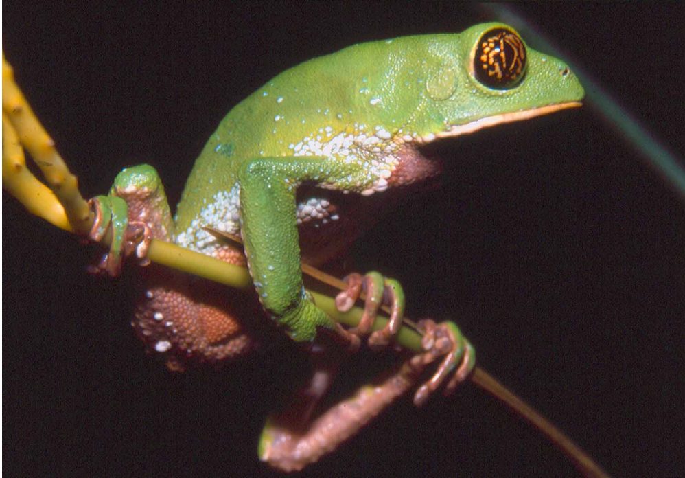
FIGURE 4. Phyllomedusa tarsius from Reserva Forestal de Caparo, estado Barinas (specimen in CVULA).

signatus ", Engystomops pustulosus , Pleurodema brachyops , and Leptodactylus insularum .