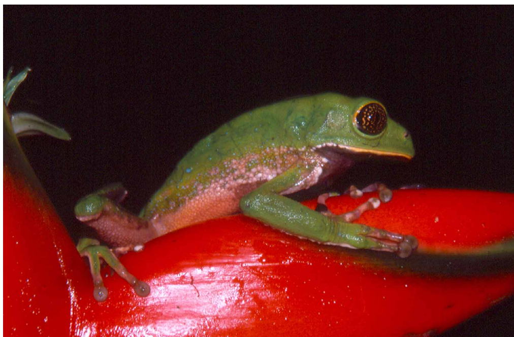
FIGURE 3. Phyllomedusa trinitatis male, from Guatopo National Park, estado Guárico (specimen not collected).