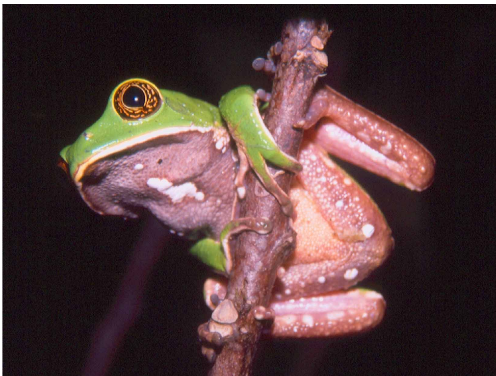
FIGURE 2. Phyllomedusa neildi sp. nov. male from the type locality, from below.

Hind limbs slender, moderately long, without calcars or other dermal ornaments; anterior edge of tibia with a row of nearly indistinct tubercles, white; interior tarsal fold indistinct; exterior tarsal fold indistinct; relative length of toes II < III < I < V < IV ; discs on toes equal to or slightly smaller than discs on fingers; inner metatarsal tubercle oval, flat; outer metatarsal tubercle absent or indistinct; subarticular tubercles round, conical; supernumerary tubercles round, conical; webbing absent between toes (Fig. 6B).